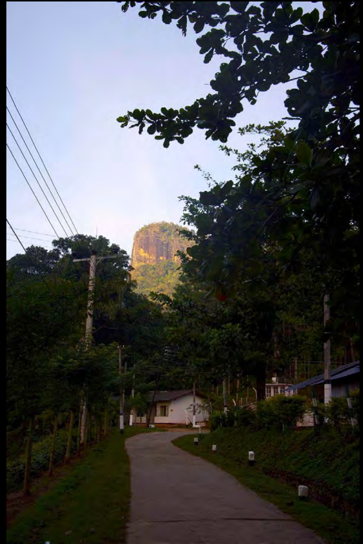
The first glimpse. From the roadway through Ambadeniya Estate