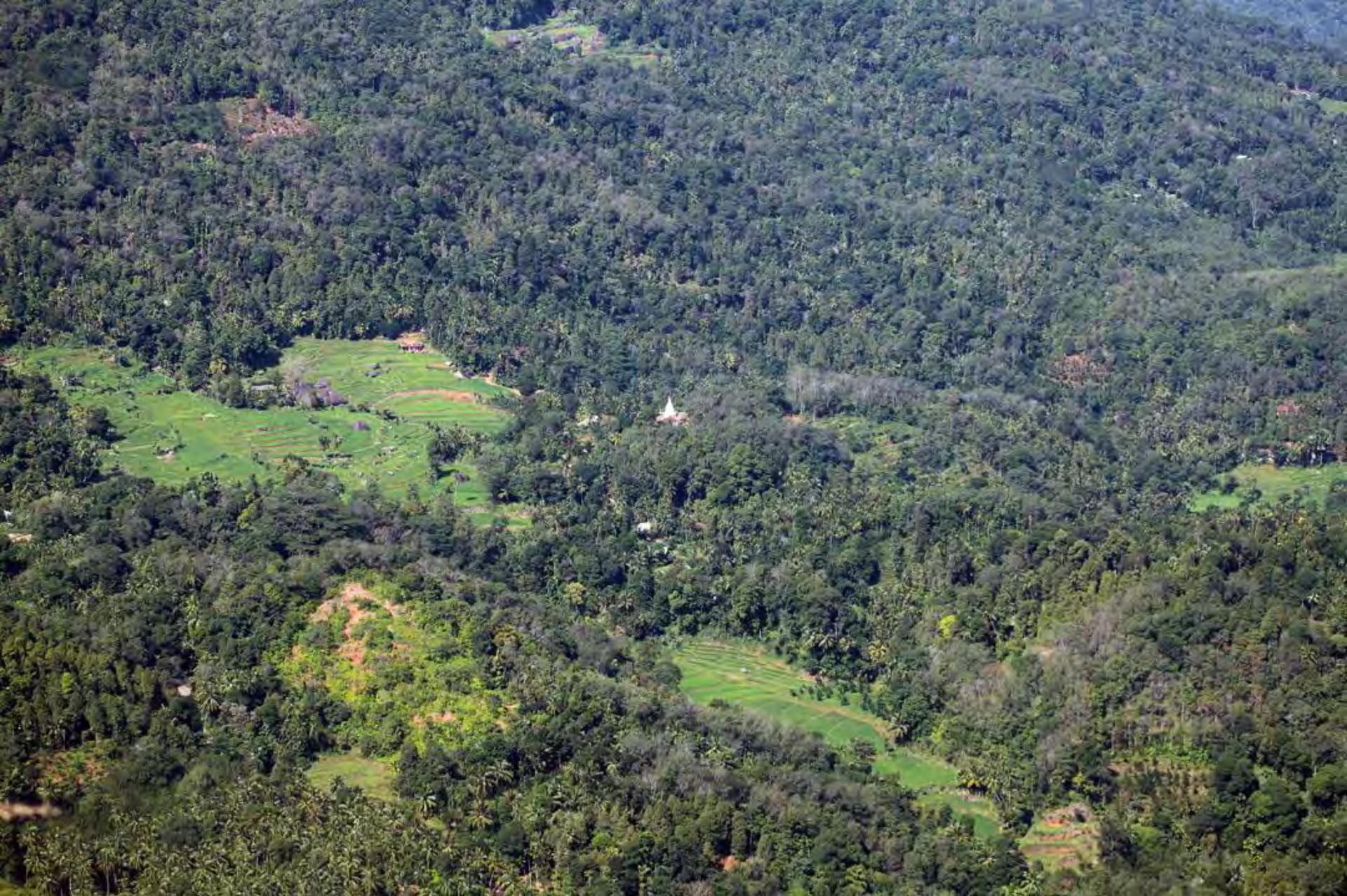
From the north face – looking east. Terraced paddy fields and a small temple. Symbols of Sri Lankan life going back to the earliest times