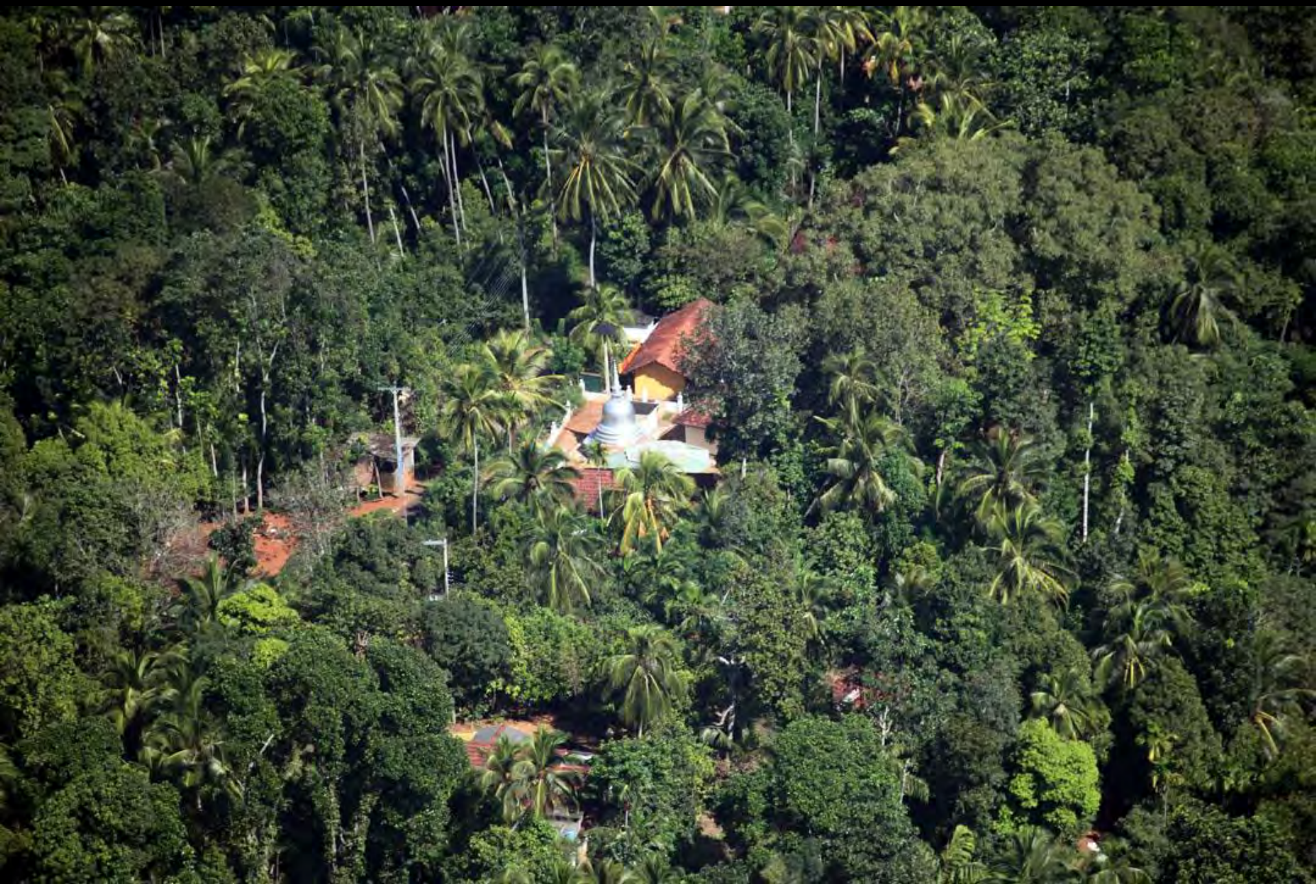
From the north face- A temple nestled in a sea of green below