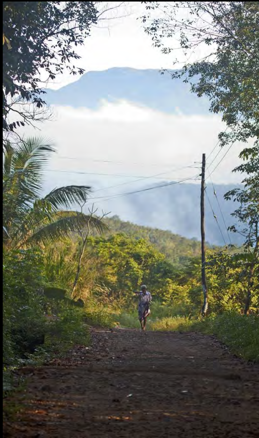
Right: A local with tools upon his shoulder walks up to work on the road upgrade. We all wished we would be as physically fit as this man when we got to his age!