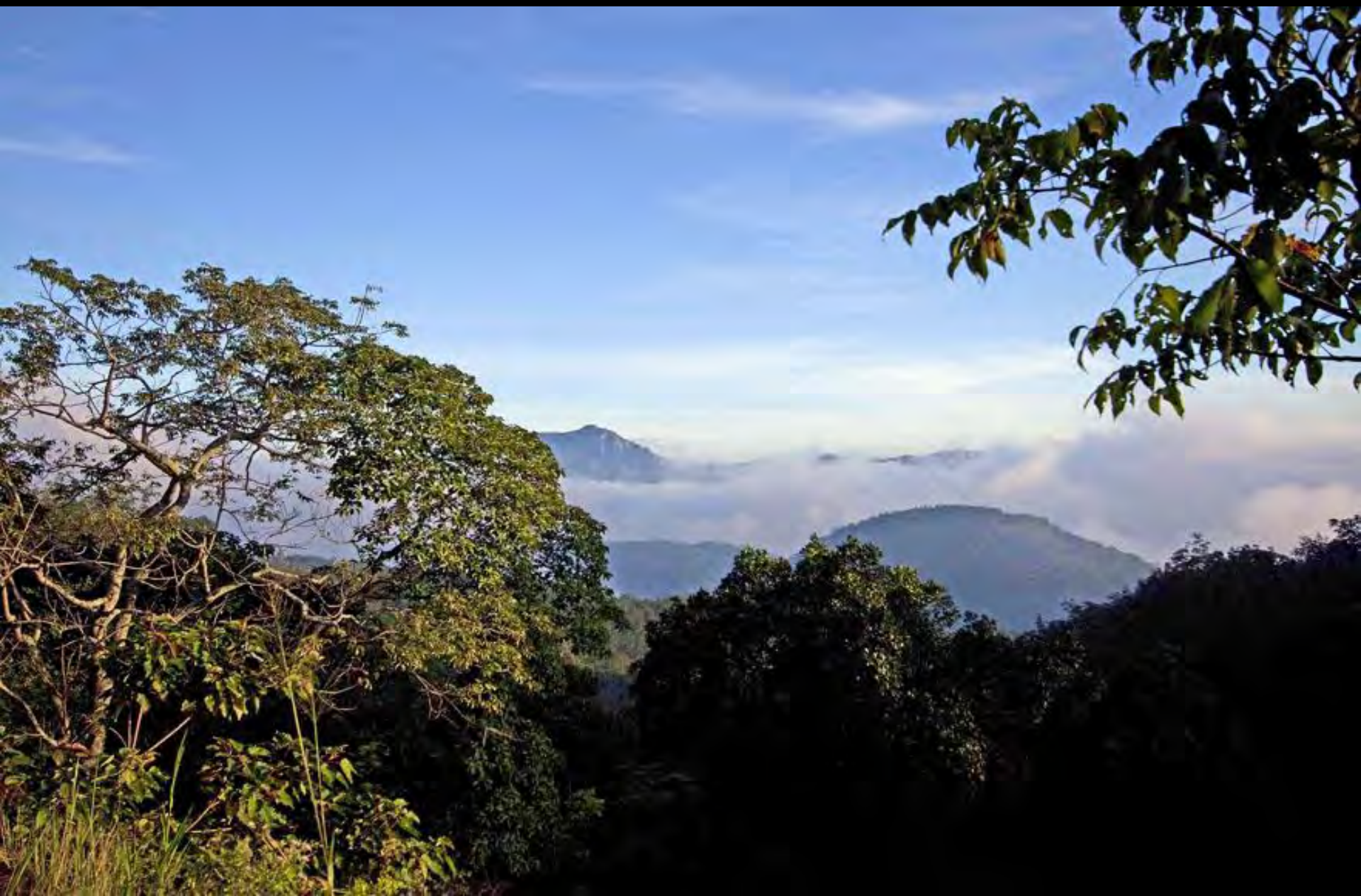
Closer to the top. A first view of Ala Gala