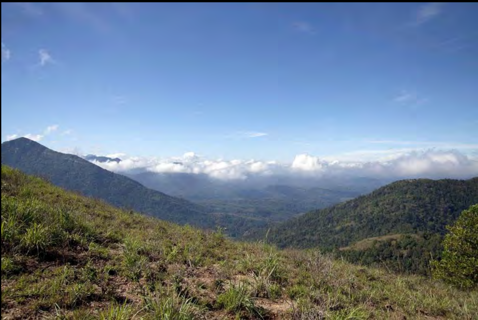
View from the north face