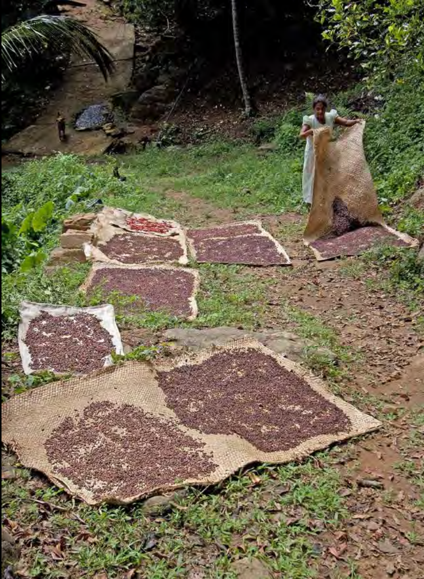
Above: Drying cloves on mats – making the best use of the bright sunshine in this lush area.