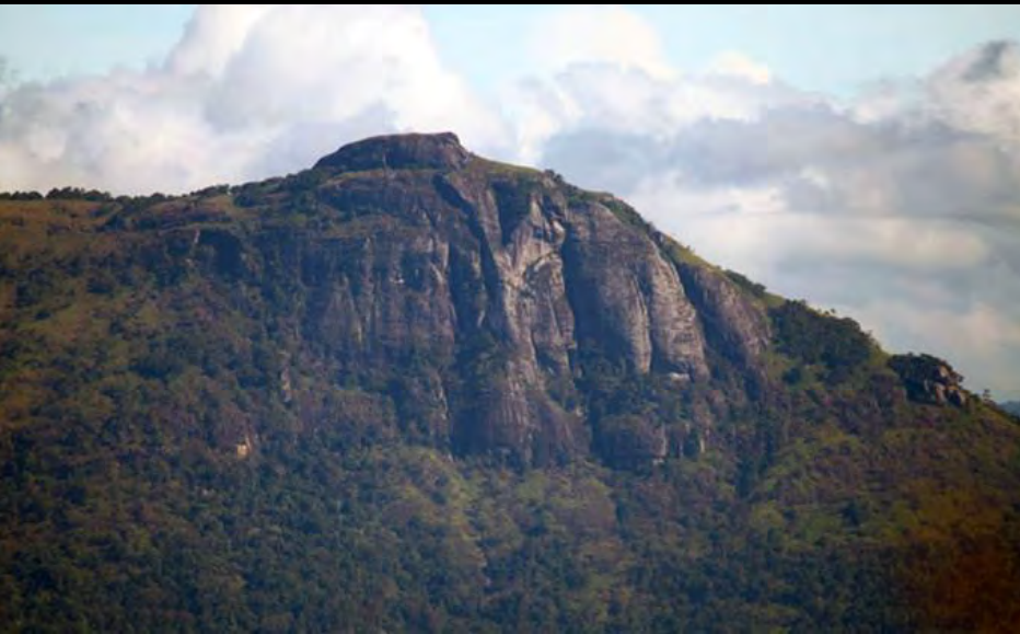
A closer look at Ala Gala and Asupini Ella Falls