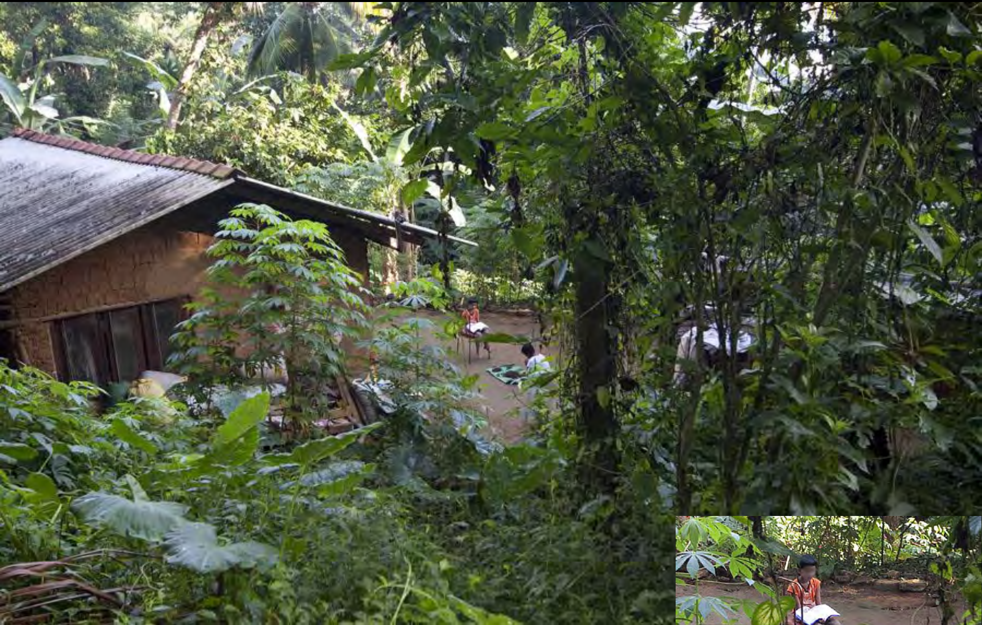
A kid does her home work in the garden. A family member keeps her company spreading cloves to dry. Not a bad environment to absorb knowledge!