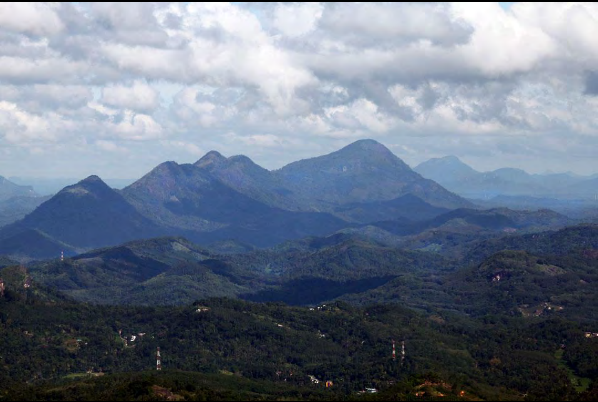
ON THE TOP! The Knuckles Range seen from the north face and a 360 degree view of breathtaking landscape.