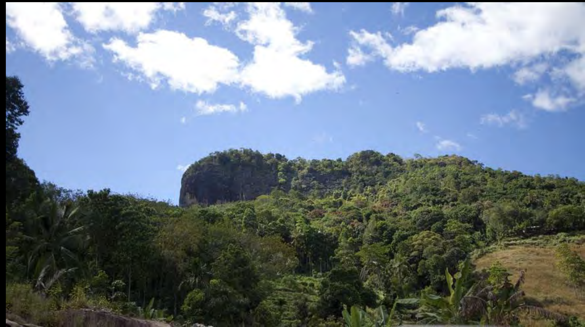
On the way down – on the estate road