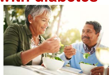
Maintaining a healthful diet can help people with diabetes control the symptoms of their condition. Having diabetes does not have to stop people from eating the foods they enjoy. However, it does mean that they should