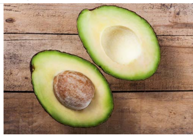
Avocados are high in nutrients and do not aggravate symptoms of ulcerative colitis.

With so many potential dietary triggers, it can be difficult for a person with ulcerative colitis to know what is safe to eat.