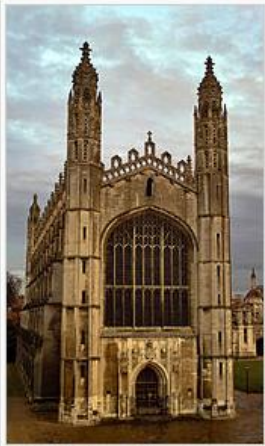
King's College Chapel, photographed on 16 November 2006.