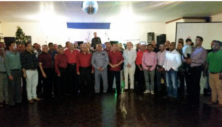
Joes Christmas function December 2015