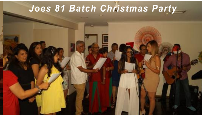
Joes 81 Batch Christmas Party