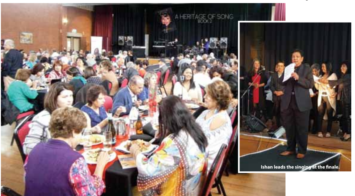
A section of the audience at lunch to the music of JAZZ NOTES